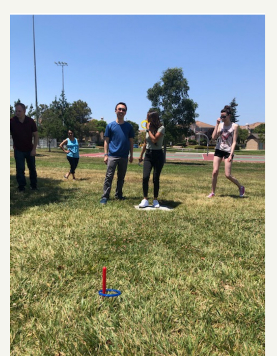
Games in the park