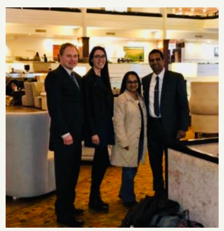
Business Conference in Palm Dessert