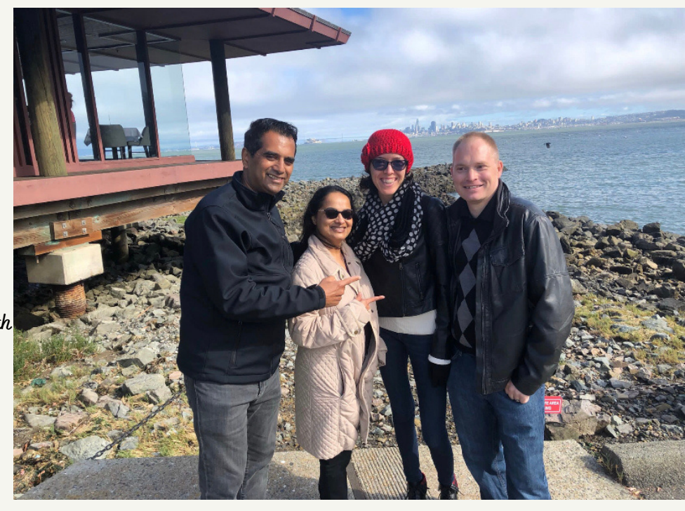
Celebrating success with business mentors in Sausalito at The Spinnaker