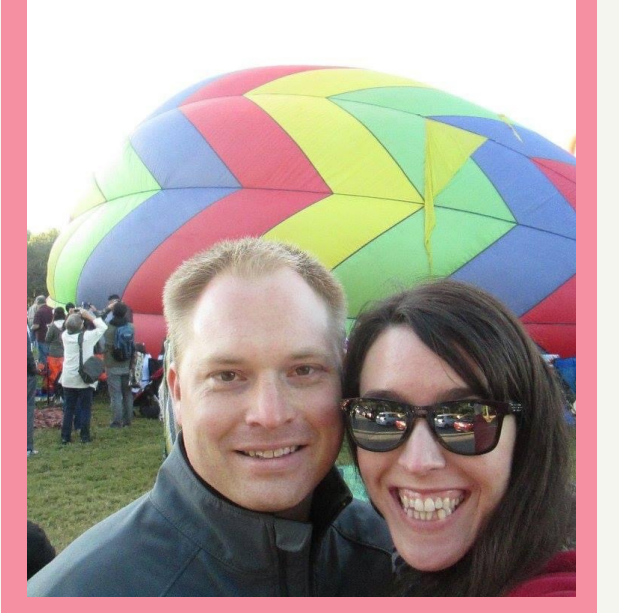
Hot Air Balloon Festival