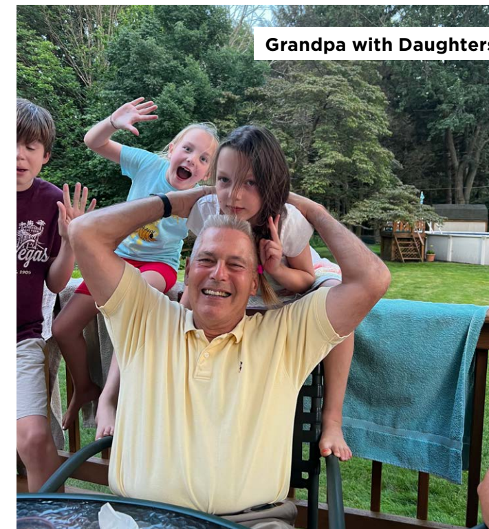
Grandpa with Daughters

The 4th of July celebration in their town, including parade, games, and fireworks, is fun and we go to NY each year for several weeks.