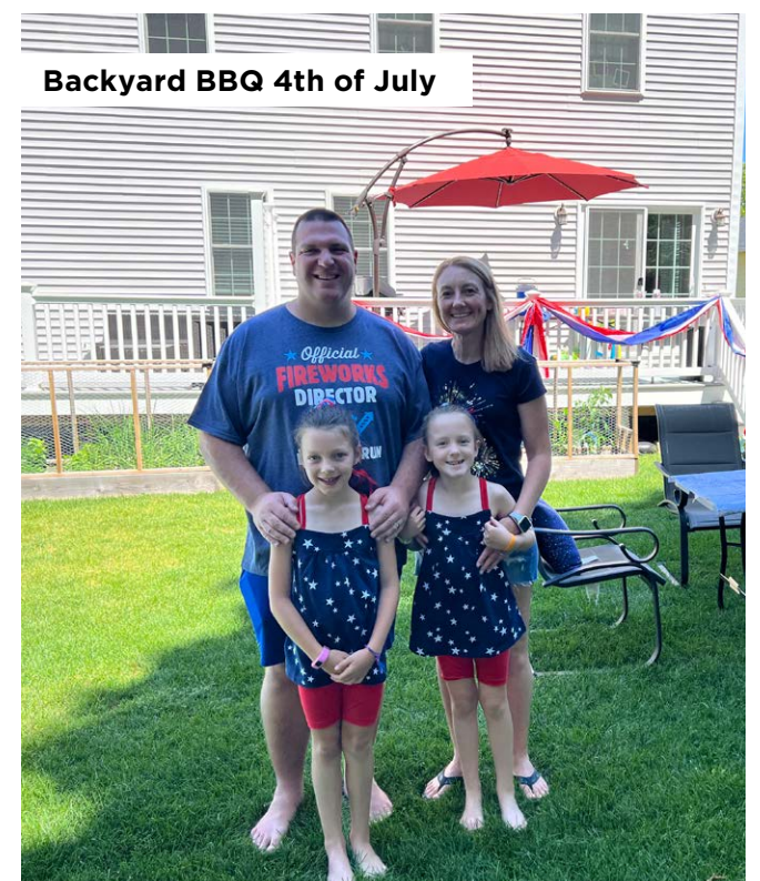
Backyard BBQ 4th of July

Our town provides us with an outstanding sense of community that we’ve never felt before. We live in a Boston suburb on a beautiful lake next to our town’s Common and large playground! The community is incredibly vibrant, with continuous activities at the library, on the Common, and even weekly 5k races around the lake. We are walking distance to the restaurants on Main Street, which includes an old-school 1950s-style ice cream parlor, and to a stop on the commuter rail that goes right into the heart of Boston. Some Fridays after school, we take the girls into the city to explore.