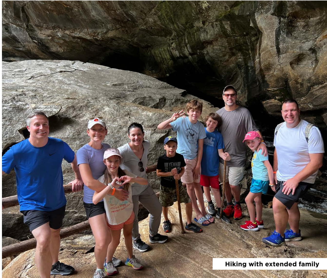
Hiking with extended family