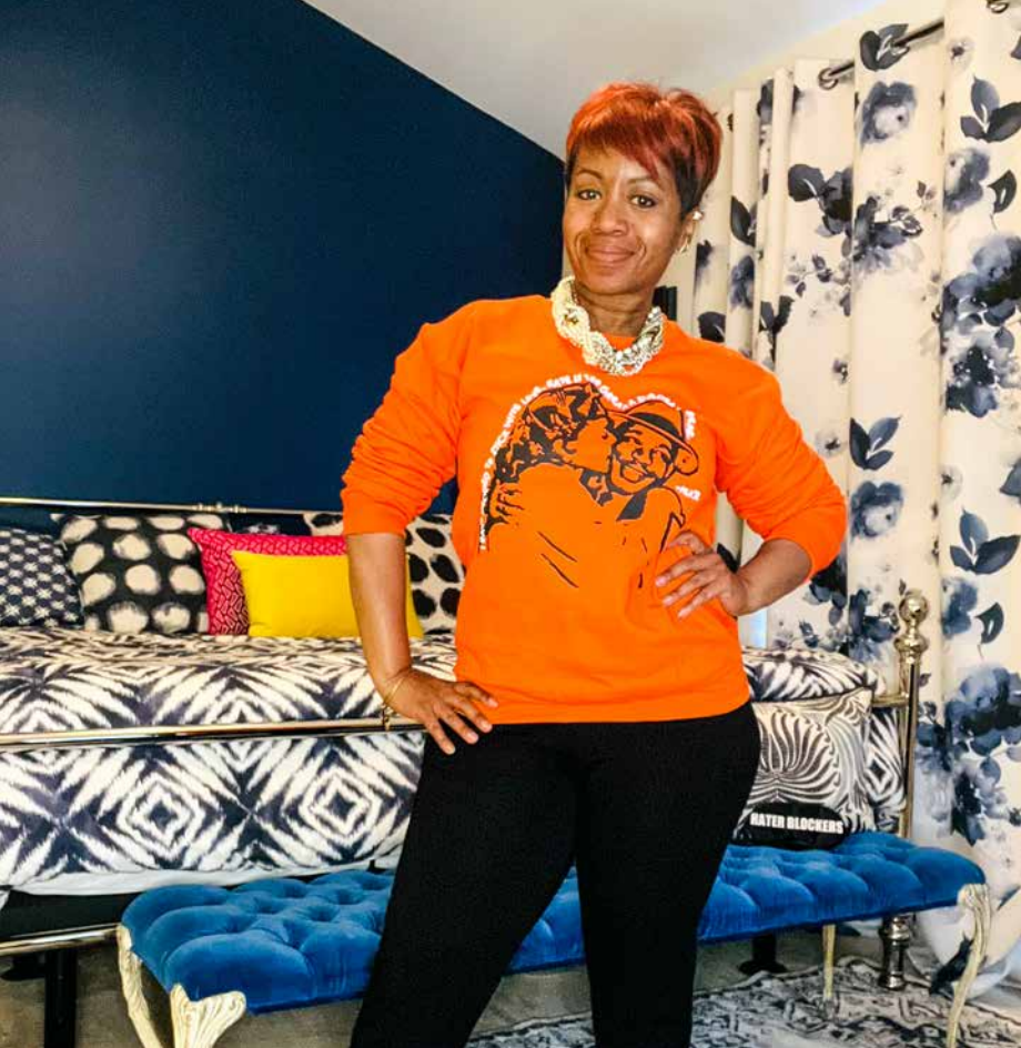
↑ MY BEDROOM

One of my hobbies is home decor, and I pride myself on having created a beautiful, but comfortable and functional home.