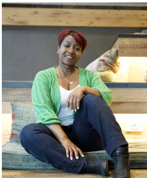
RELAXING AT MY FAVORITE COFFEE HOUSE