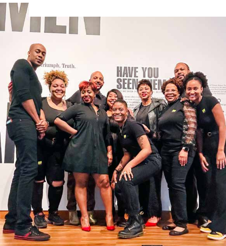
MY AMAZING COWORKERS