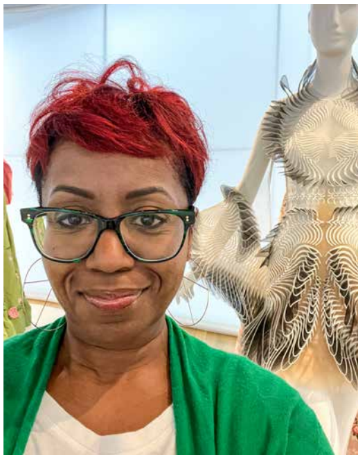
↑ MUSEUM EXHIBIT IN CHARLOTTE

I decorate with lots of color, and also include family pictures and items with personal significance. I love to read, so there are books shelved and stored all over the house! There is plenty of hardwood flooring and space to play and dance, and a dedicated bedroom for your child. I want to maintain a space that provides both shelter and support for a child's developing personality, gifts and interests.