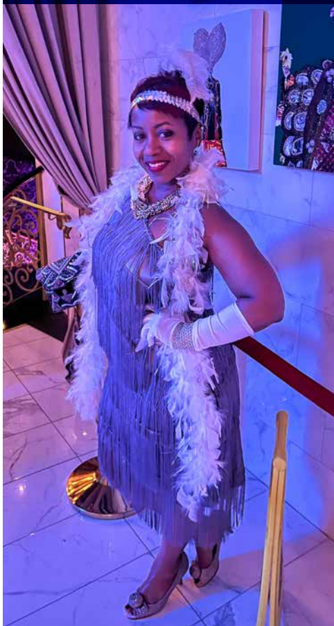
FLAPPER GIRL FOR HALLOWEEN