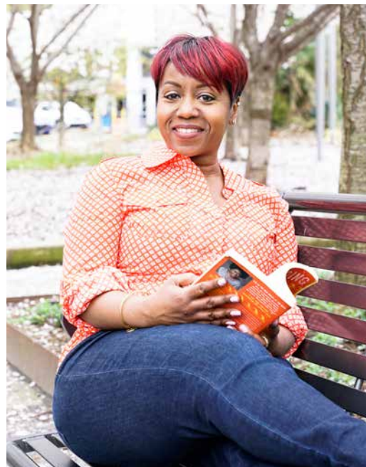
↑ READING AT BEARDEN PARK