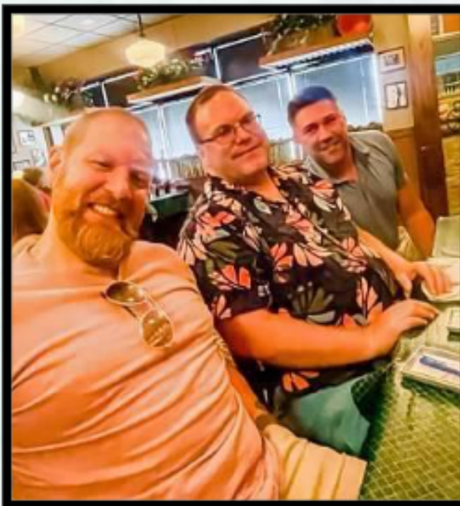
Dinner with friends