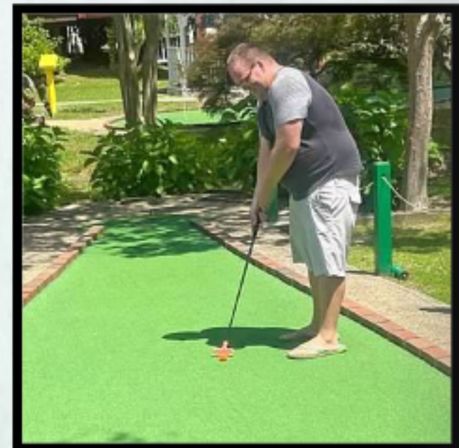
Playing mini golf