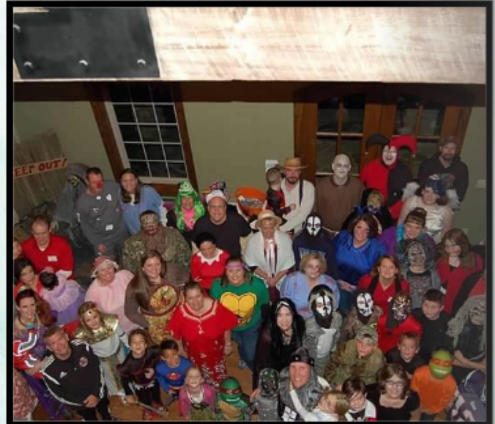
Friends' Halloween party