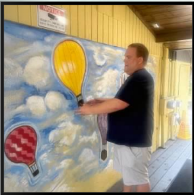
Hanging out in Helen, GA