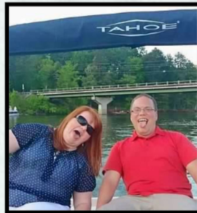
On the boat