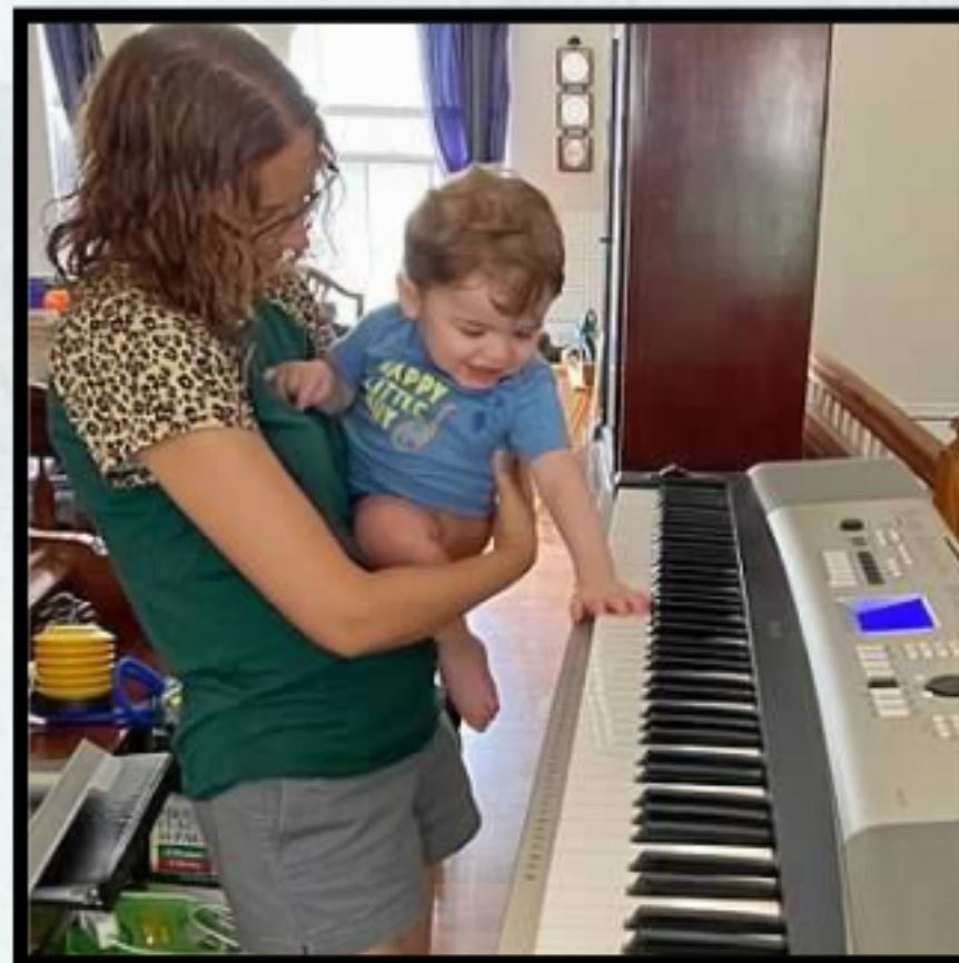
Little cousin's first piano lesson