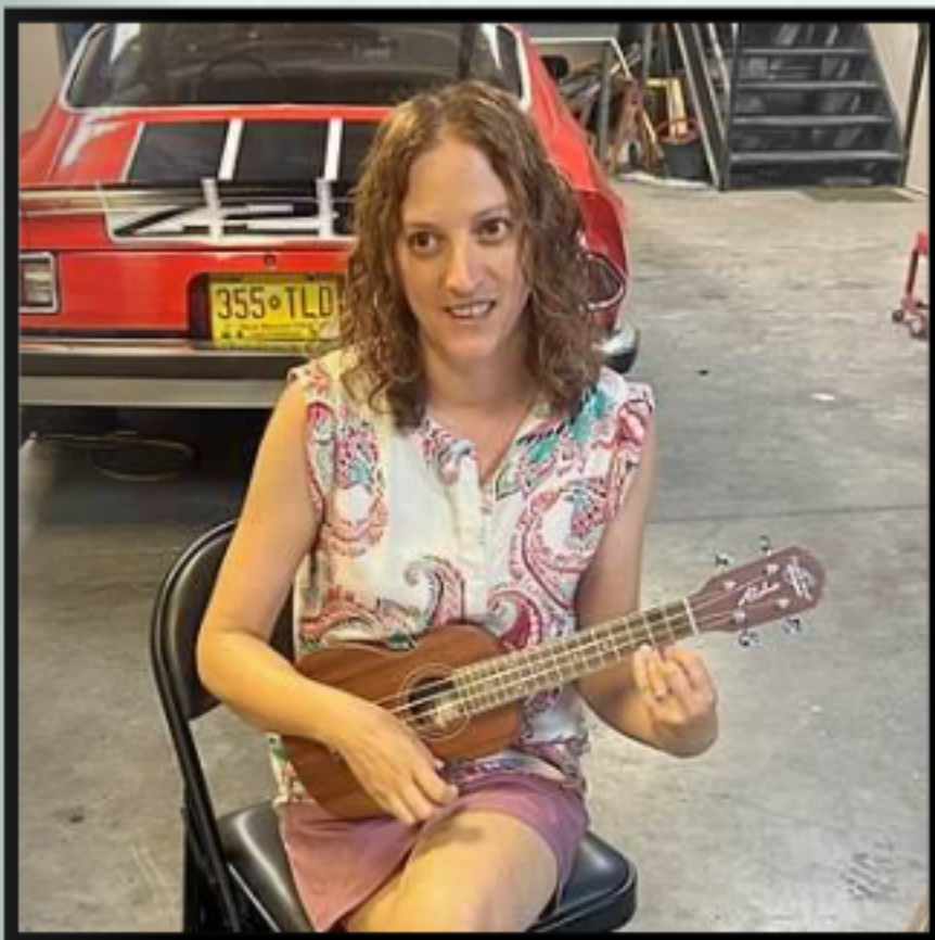
Leading singing on the ukulele