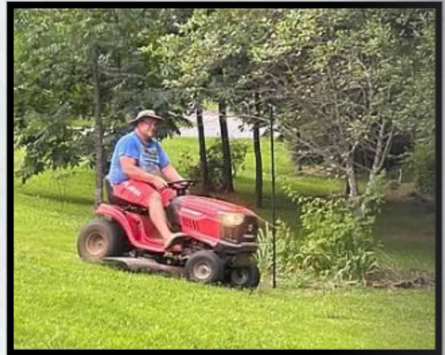
Cutting the grass

He also enjoys planting flowers and creating flower garden arrangements. This is a skill he learned from his grandmother.