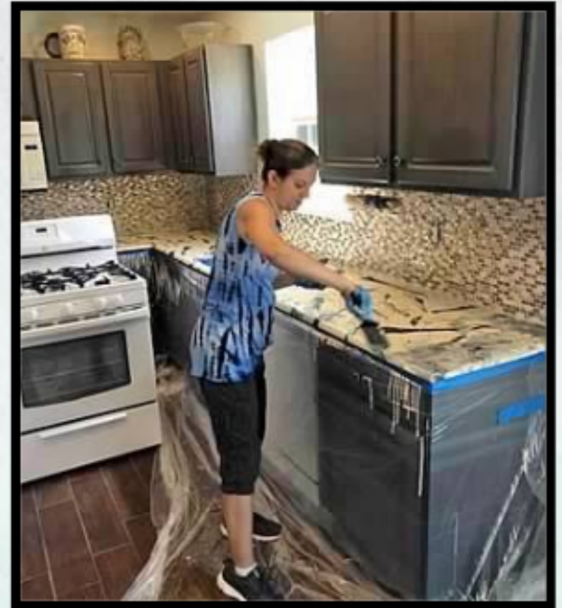
Home improvement project