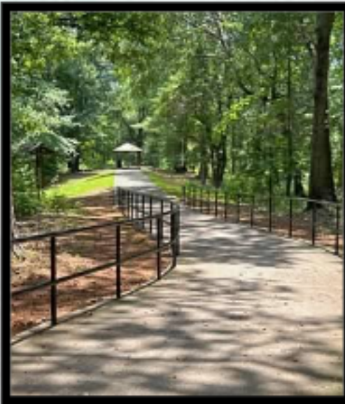
Poole's Mill Park