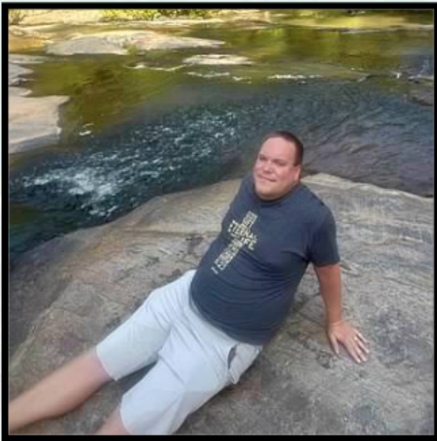
Hanging out at Poole's Mill Park