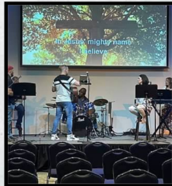
Praise Team practice