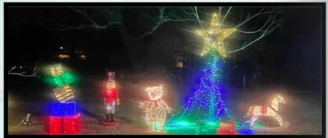
Our Christmas yard lights