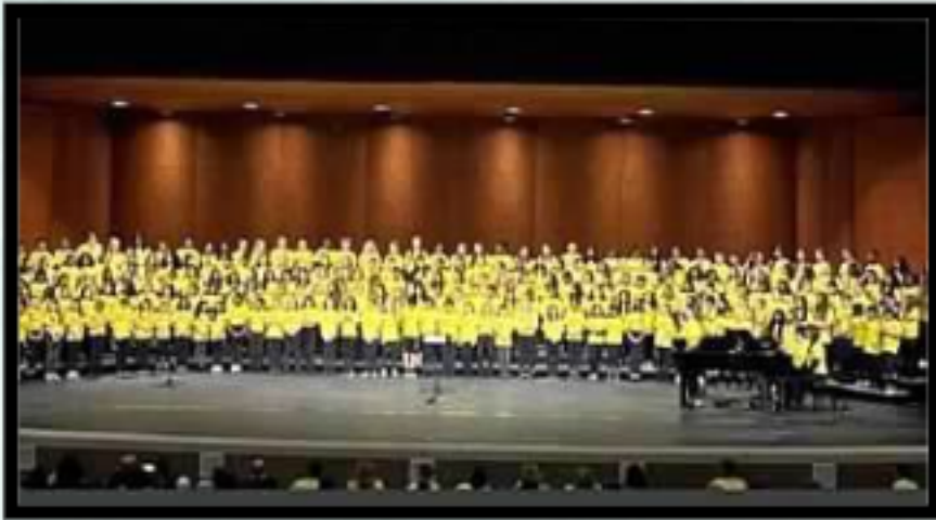
Elementary honor chorus