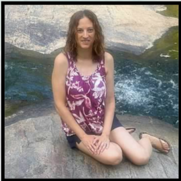
Poole's Mill Park

She looks forward to sharing her love of music with a son or daughter. She'll be the one to support your child in whatever passions they may develop.