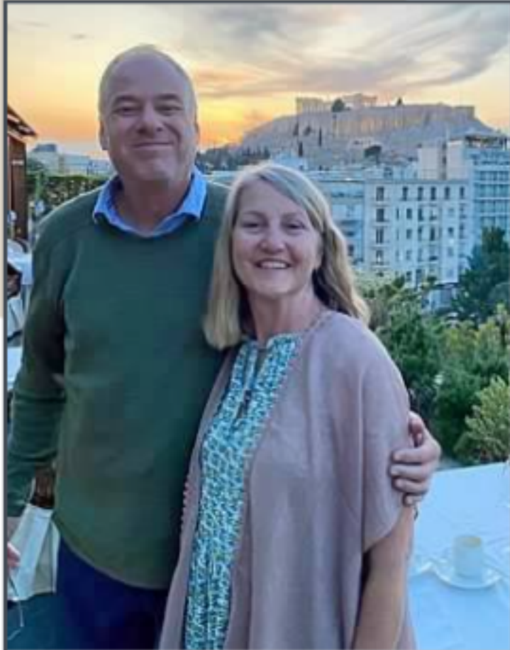
Alli's parents celebrating their wedding anniversary.