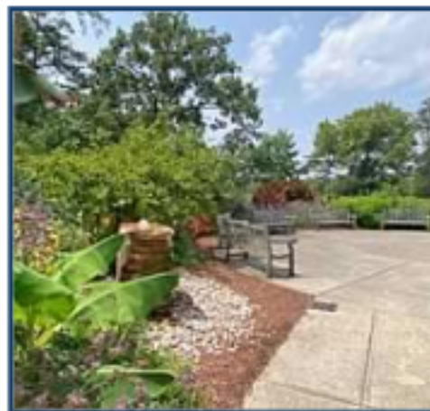
local park - 3rd largest in Cincinnati