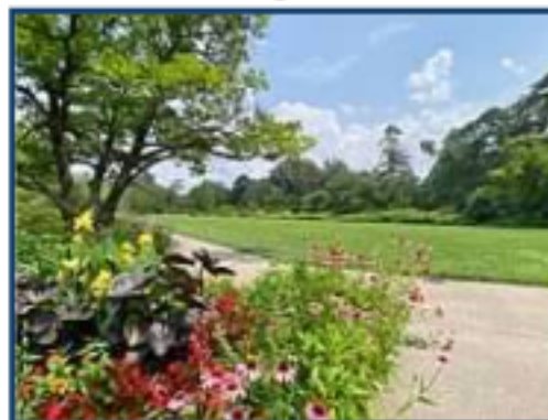
Local park - lots of rooms for picnics!

Turn right on the bike path to go to Alli's parents' house and hiking trails. Turn left to go to the library and to get fresh donuts.