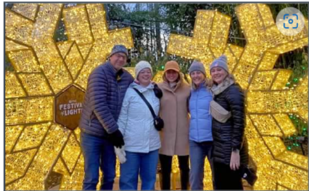
Festival of Lights at the zoo. Our family goes every year to see the lights and eat sugar-roasted almonds.