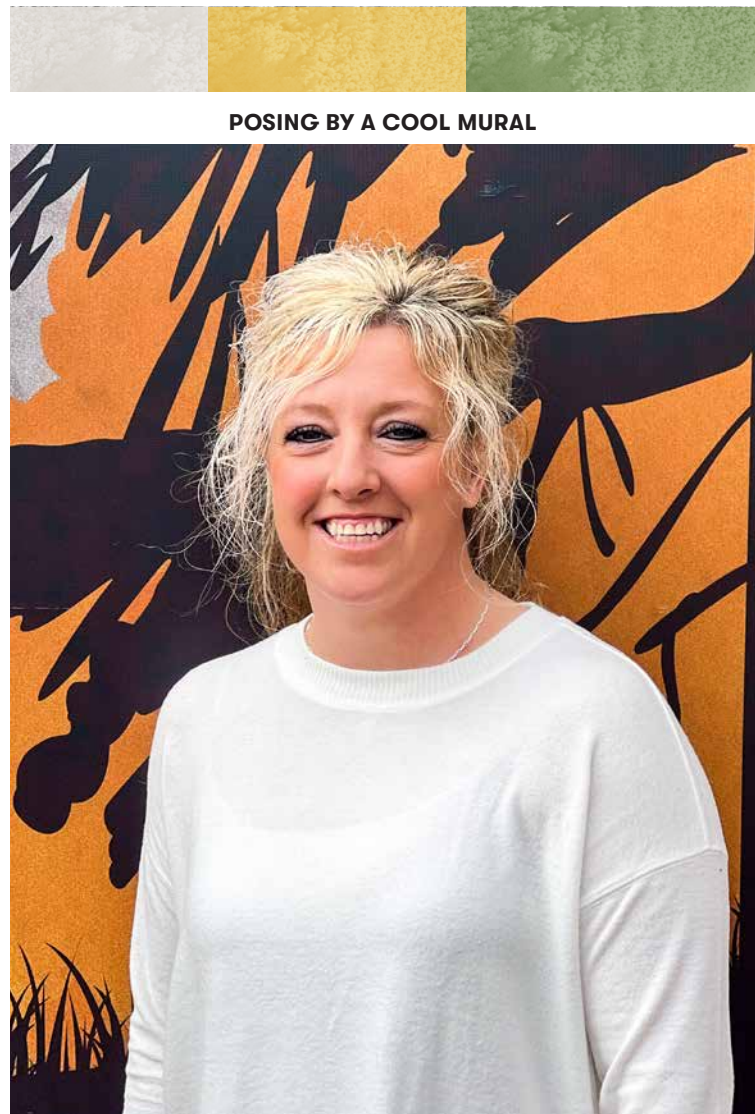
POSING BY A COOL MURAL