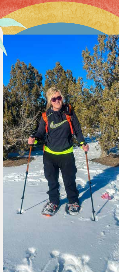
I ENJOY COLD WEATHER OUTDOOR ACTIVITIES TOO!