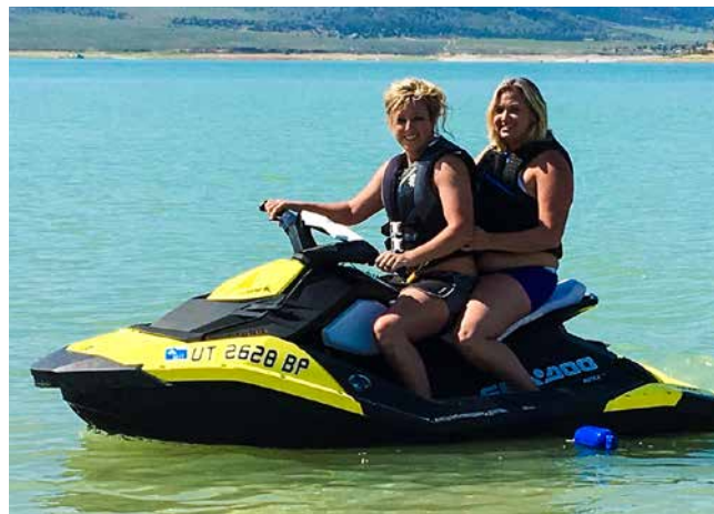
CAMPING AND PLAYING AT THE LAKE