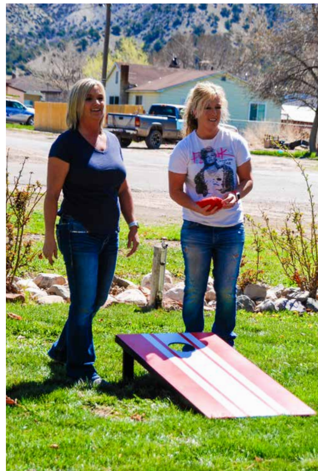
PLAYING CORNHOLE IN OUR FRONT YARD