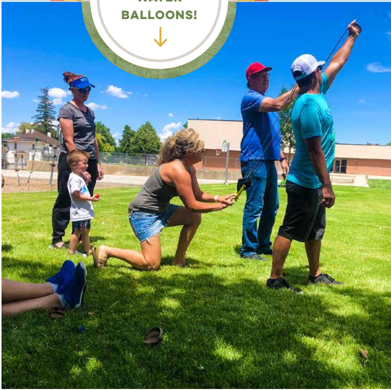
MAKING CHRISTMAS ORNAMENTS WITH FAMILY