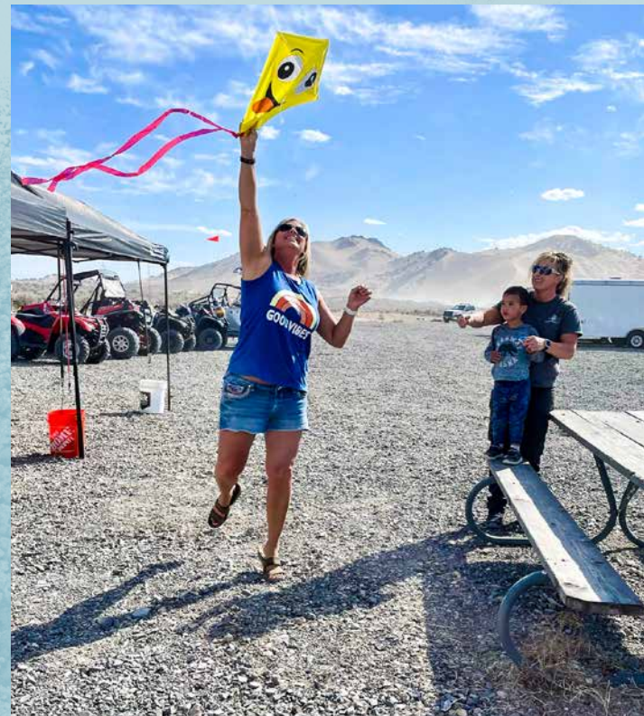
FLYING A KITE WITH OUR NEPHEW

We have an annual family sleepover where we play yard games, make crafts, eat, watch a movie outside and launch water balloons. The holidays are festive with our family. Together, we do arts and crafts, pumpkin carving, making Christmas ornaments, and building gingerbread houses. These are family traditions we are excited to share with our little one. Being open to becoming a transracial family, we will incorporate traditions from the child's culture into our lives. Family is one of the most important things in our lives. Our family is fun and supportive; they even show up for our dogs' birthday parties.