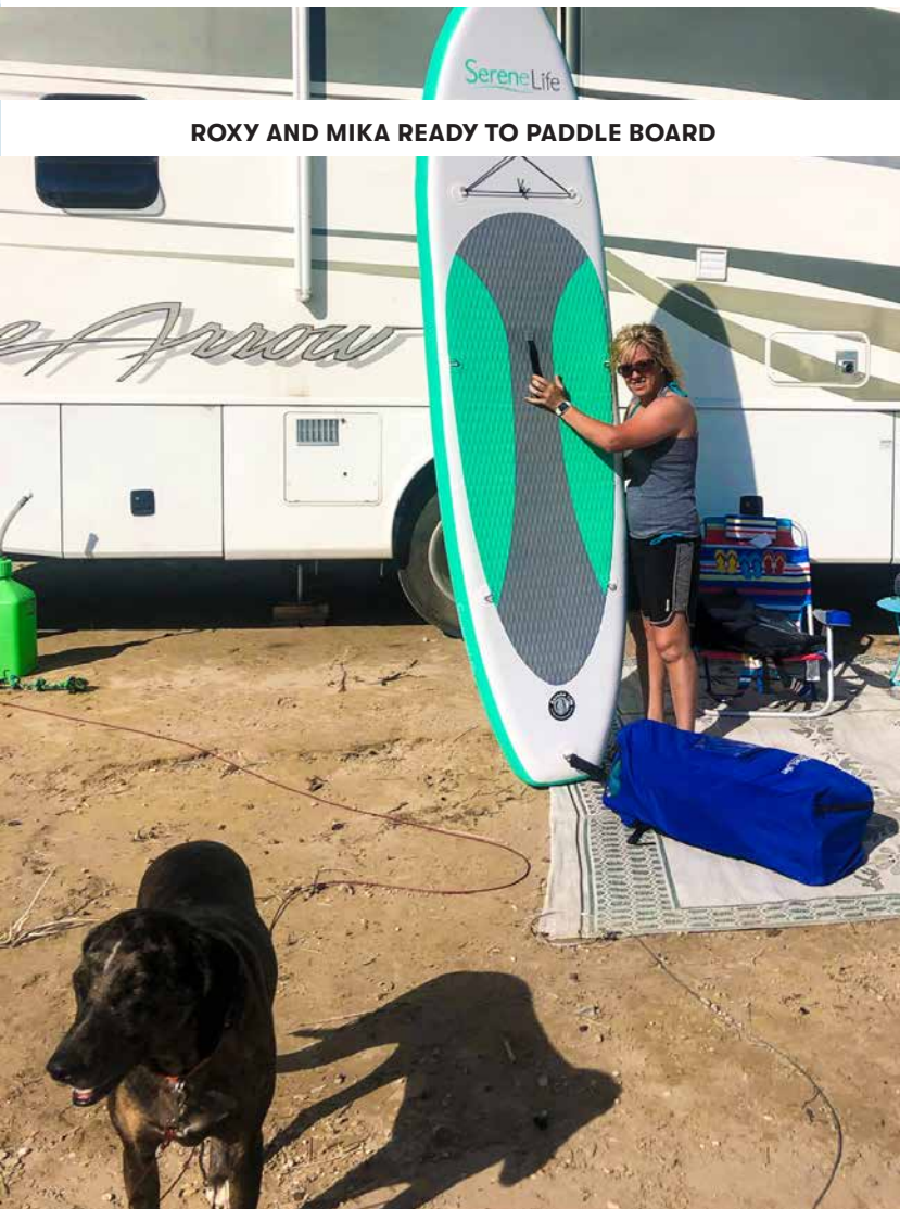
ROXY AND MIKA READY TO PADDLE BOARD