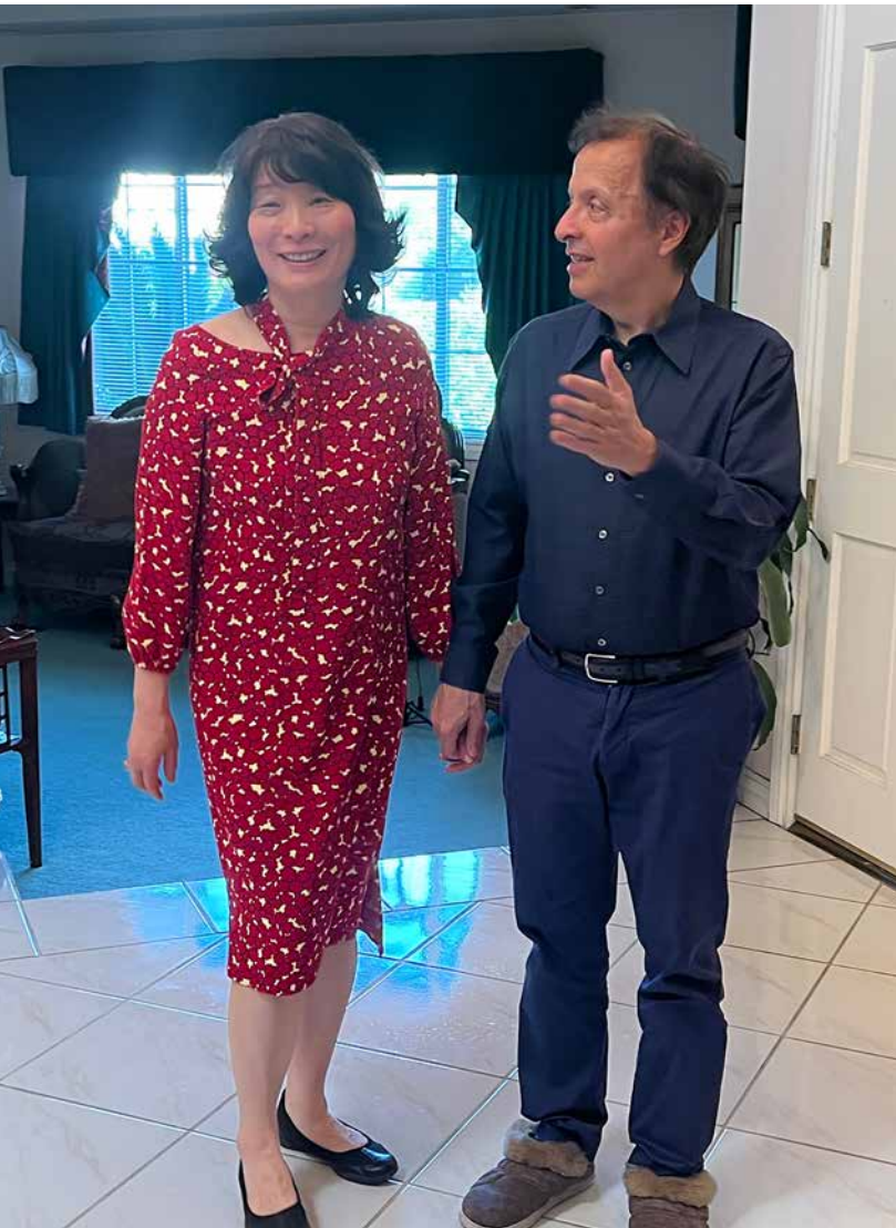
JUE LOVES PLAYING THE PIANO