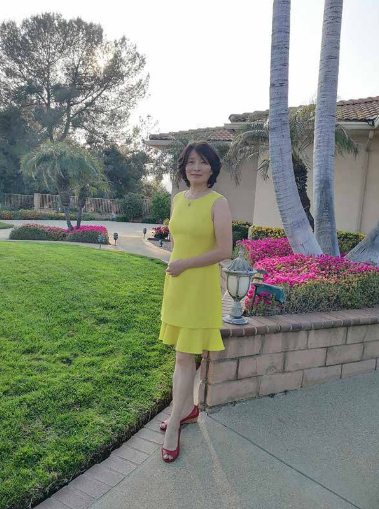
READY FOR DATE NIGHT