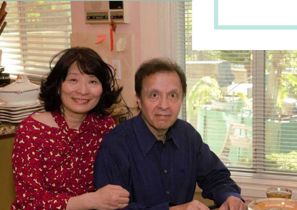
ENJOYING AN EVENING AT HOME

We were practicing speech and improving our communication and