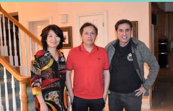
CHRISTMAS WITH FRIENDS