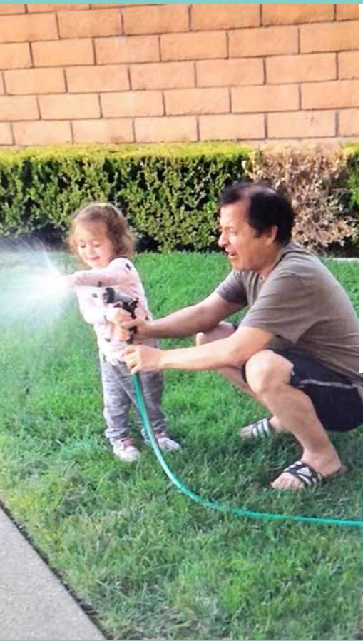
PLAYING WITH OUR FOSTER DAUGHTER