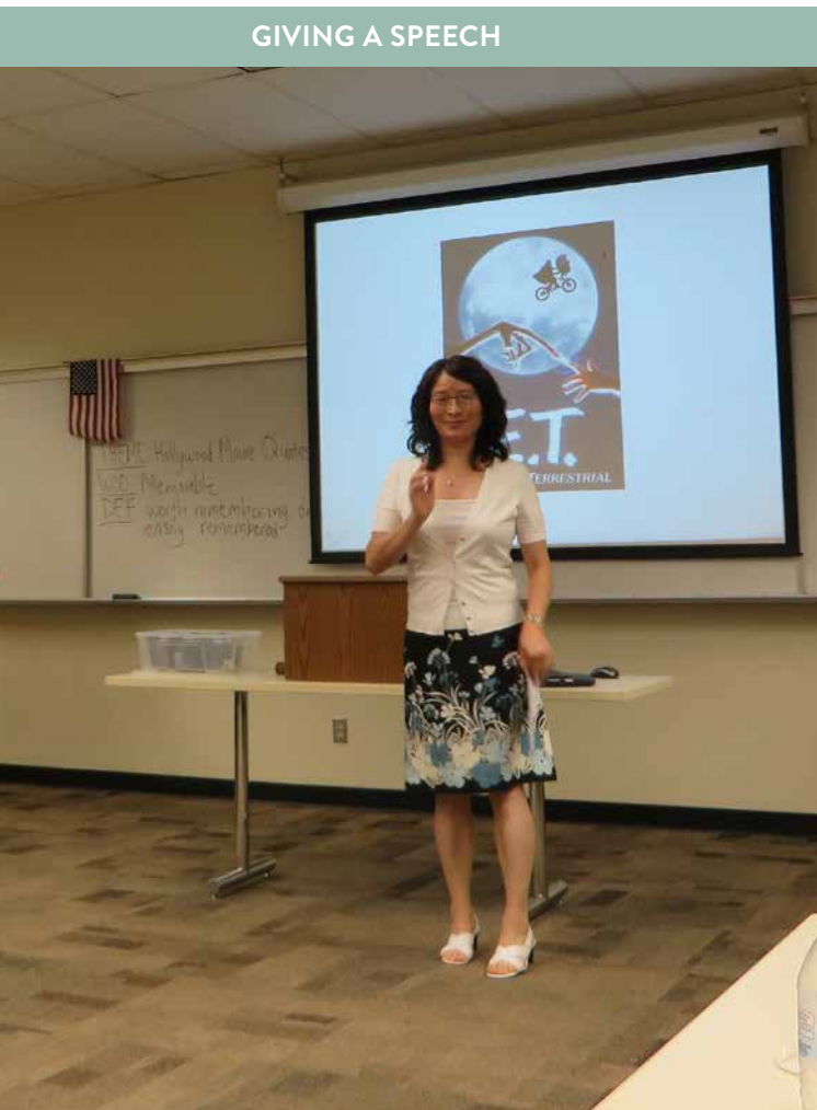
GIVING A SPEECH