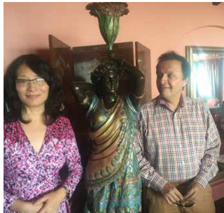
A TRIP TO LAGUNA BEACH