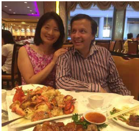
WE ENJOY GOOD FOOD