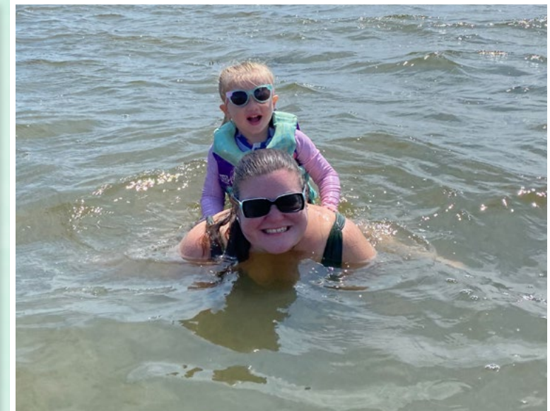
My cousin's daughter and I are fellow mermaids

In the winter, there's an emphasis on holidays. Thanksgiving is often at our house, with attendance some years coming in at over 20 friends and family members. Christmas tends to be quieter, but I love the slower pace, the conversations by the fire, the holiday music, and finding the perfect gift for someone. I was one of those kids who could never sleep on Christmas Eve (up until about age 25), and I hope to continue that kind of joy with a child.