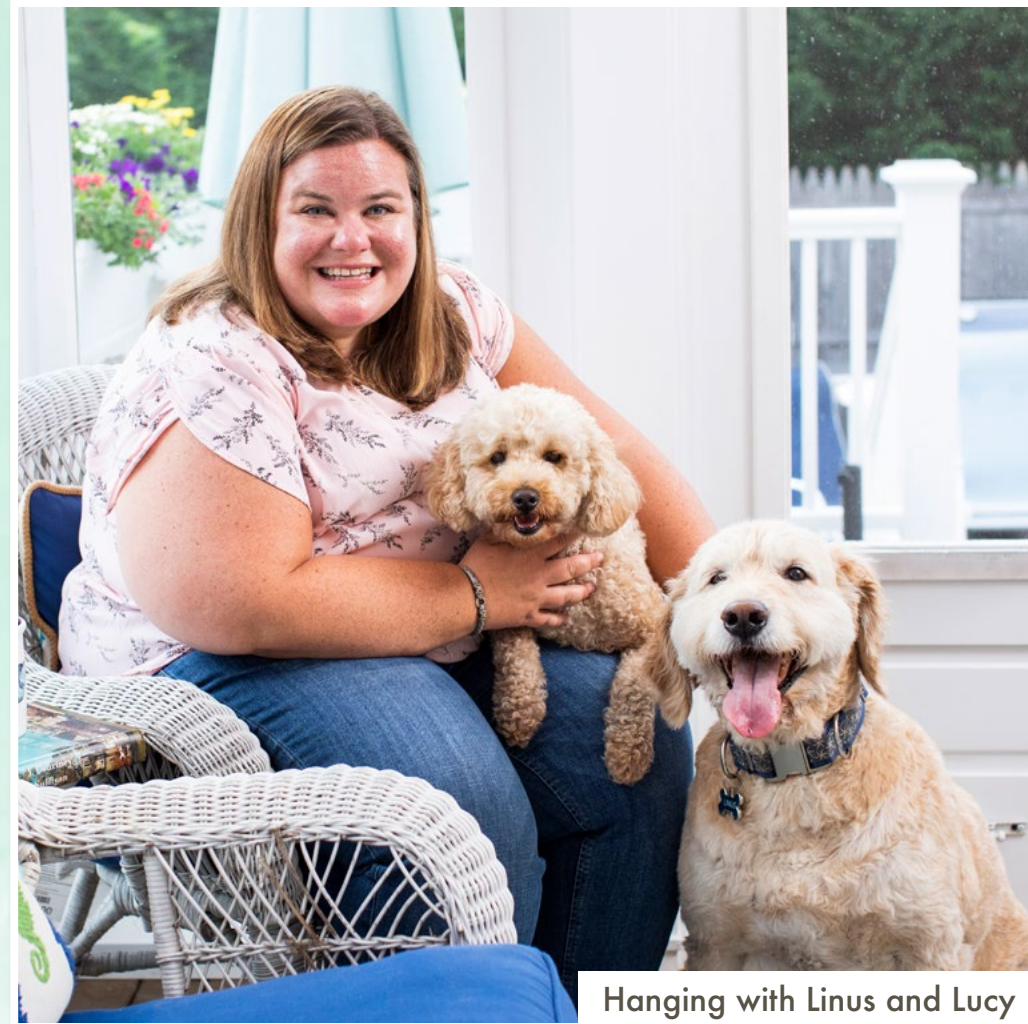
Hanging with Linus and Lucy

We share many of the same interests, and enjoy talking about what we've read, catching up on TV and movies, planning the gardens and the next place we travel, and playing with the pups.