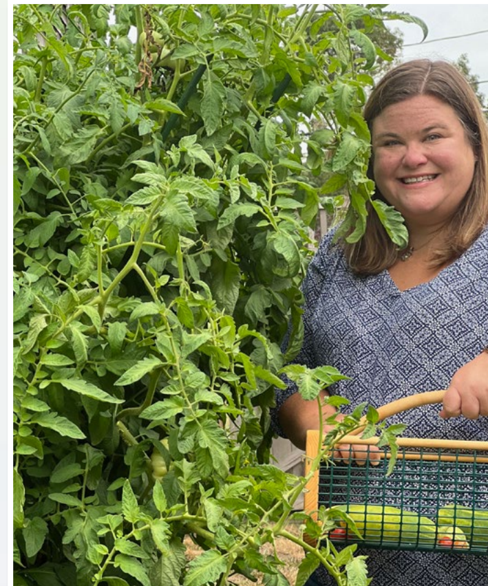
I added vegetables to my flower and herb gardens this year

Two and a half years ago, I relocated to the Massachusetts coast; I grew up coming here and it's where my heart has always been. Moving here permanently has allowed me to explore in new ways - I bought a bike, take walks on the beach after work, and have begun cultivating the gardens that my mother originally planted here. I also added a vegetable garden for the first time this year and learned that I'm going to need to expand the beds next year to accommodate all I want to grow! Having the opportunity to spend the day at the beach and be in and on the water regularly is something I cherish, and I feel very lucky to be able to have this be part of my everyday life while also being able to continue to excel in my career.