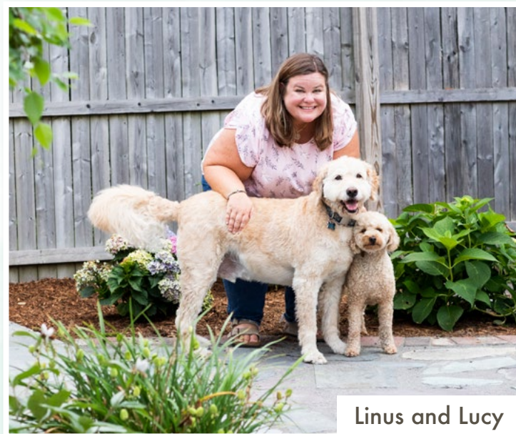
Linus and Lucy

I live in what I'd describe as a quintessential coastal home – large and shingled with a yard that gives plenty of room to spread out and enjoy the sea breezes. There's a neighborhood beach at the end of the street and another within walking distance that has swings and a play area that I imagine will be a regular part of my routine with a child. I'm on a quiet street, with friendly neighbors that care about each other.