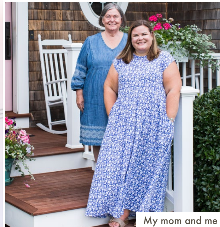
My mom and me

Family has always meant the world to me. My parents and I were always exceptionally close, but I'm close to extended family and have developed a family of friends as well. While much of my family is located close by, we're the kind of family whose closeness surmounts any distance. My grandparents, for example, lived in Florida for much of the year when I was young, yet would drive up simply to help when I was sick. It's that type of commitment to family that they instilled in all of us and that continues today.