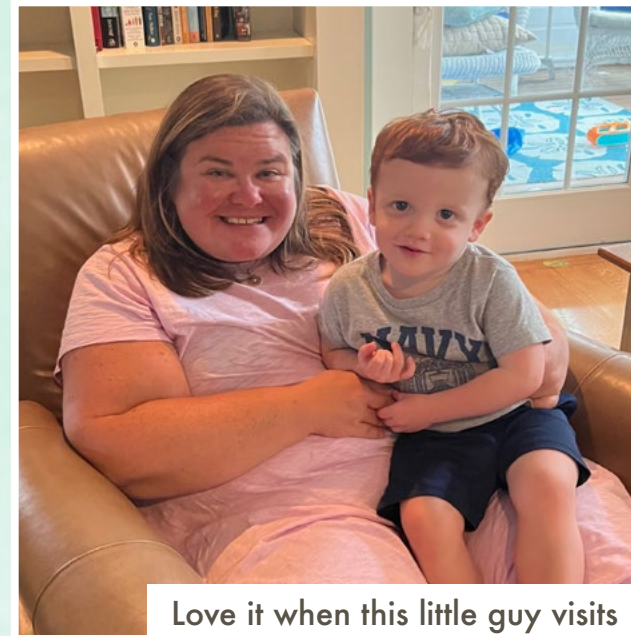
Love it when this little guy visits

These are all activities I've done with children I'm close to and that I look forward to sharing with a child of my own. In quieter moments, it's tending to the garden and reading out on the deck or in the hammock. I can't wait to curl up in a chair on the porch and read books with a child.