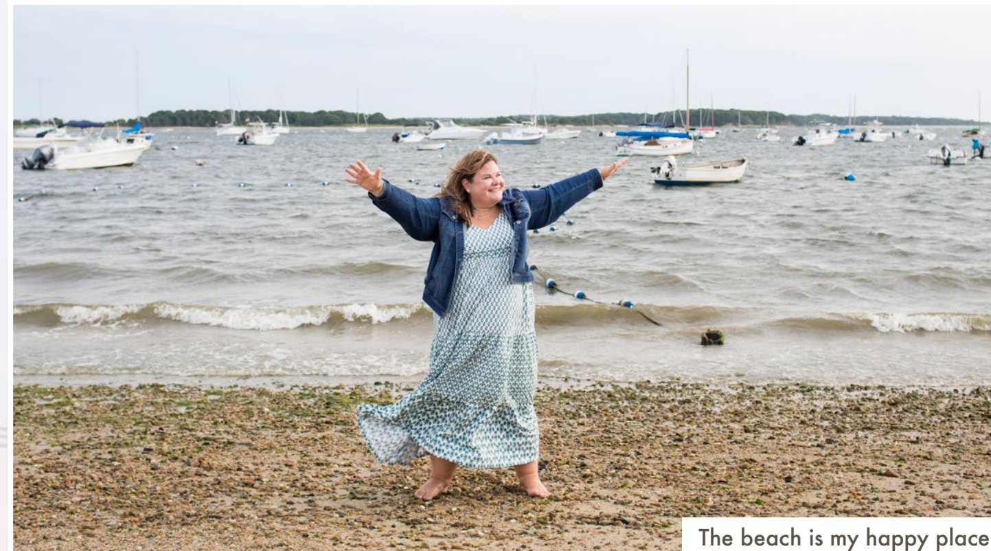
The beach is my happy place