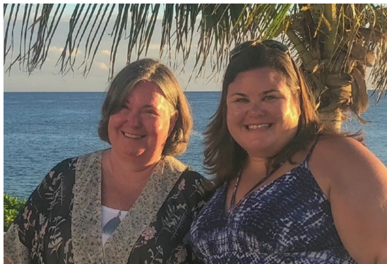
My mom's been my best travel buddy since birth

In the summer and early fall, I love days at the beach, bike rides along the water, swims in the bay down the street, and sometimes even clamming or kayaking.