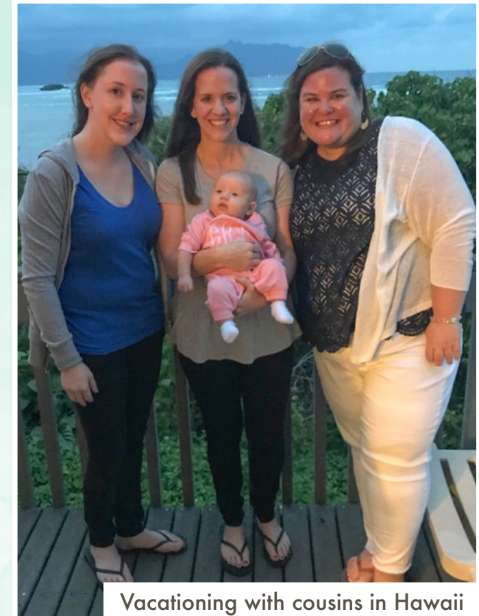
Vacationing with cousins in Hawaii

I often take a vacation in the spring, seeking out beach weather that hasn't quite made it to New England by that point. I can't wait to share these travels with a child. When I return, it's time to start planning the gardens and getting ready for warmer days back home.