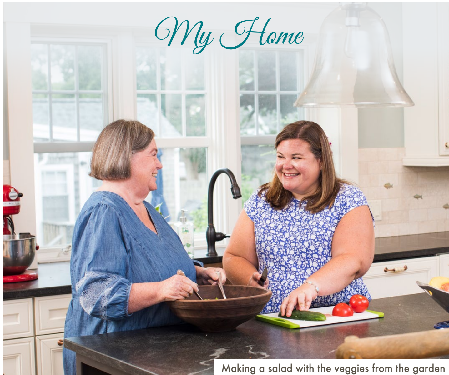
Making a salad with the veggies from the garden

I live in what I'd describe as a quintessential coastal home – large and shingled with a yard that gives plenty of room to spread out and enjoy the sea breezes. There's a neighborhood beach at the end of the street and another within walking distance that has swings and a play area that I imagine will be a regular part of my routine with a child. I'm on a quiet street, with friendly neighbors that care about each other.