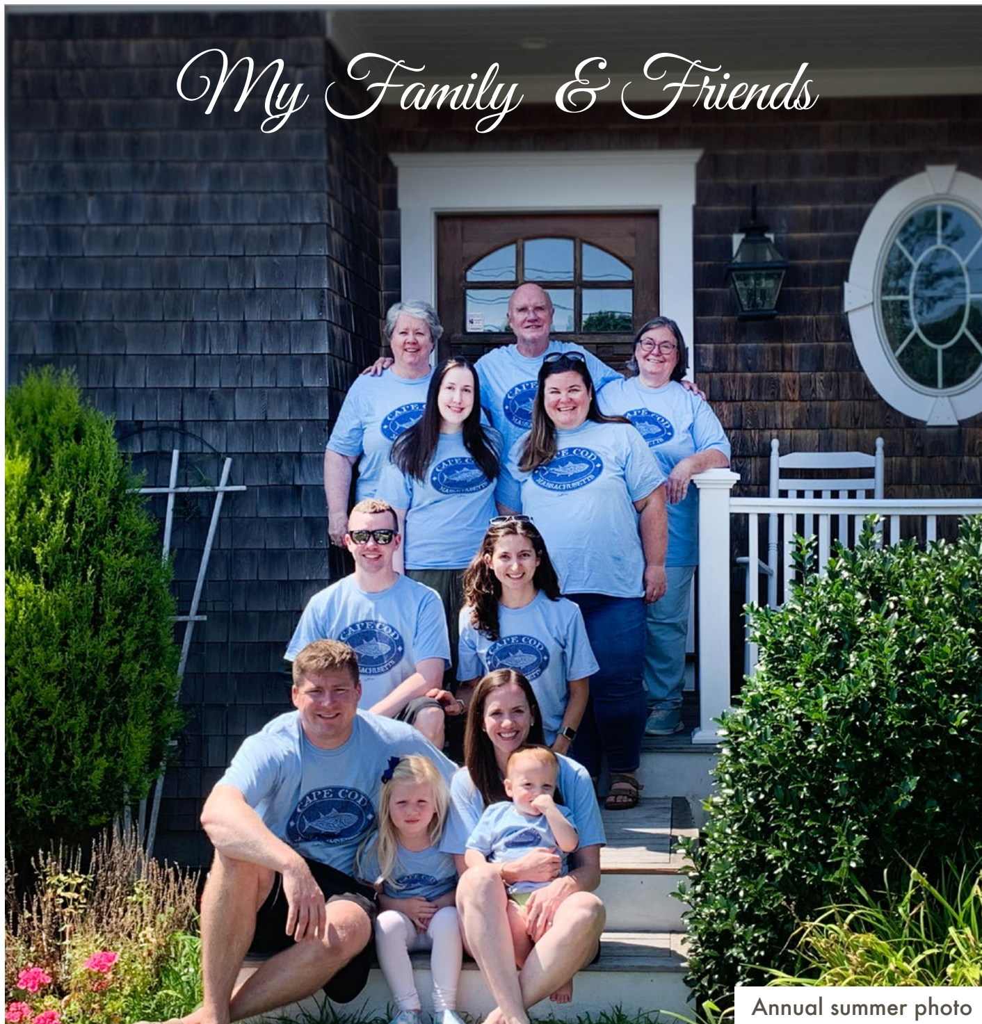
Annual summer photo

Family has always meant the world to me. My parents and I were always exceptionally close, but I'm close to extended family and have developed a family of friends as well. While much of my family is located close by, we're the kind of family whose closeness surmounts any distance. My grandparents, for example, lived in Florida for much of the year when I was young, yet would drive up simply to help when I was sick. It's that type of commitment to family that they instilled in all of us and that continues today.